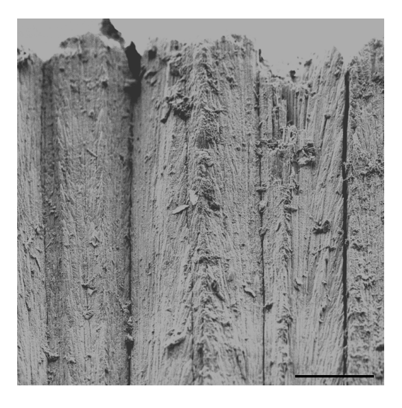
FIG. 1. Columnar microstructure of DVD coating. Marker is 20 µm.

In recent years, the technique of USAXS has been significantly advanced by the availability of new highbrilliance x-ray synchrotron sources. Currently, USAXS studies can interrogate the microstructure features in a size scale ranging from nanometers to micrometers by using an x-ray beam size of 0.3 \times 0.3 mm and provide quantitative volume fractions, surface areas, and size on a calibrated absolute scale. A 2-D collimated modification of USAXS [5] was used to study highly anisotropic structures by adjusting the sample's azimuthal rotation